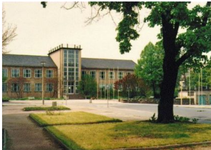
Barkhausen-Bau: Main entrance seen from Mommsenstr.

The summer school will take place at Barkhausen-Bau, the main building of the previous faculty of electrical engineering, mainly in room 106 (ground floor) and room 218 (first floor), for details see https://navigator.tu-dresden.de/etplan/bar/01 . On Saturday, we will have the Network Coding sessions in the Falkenbrunnen, Würzburger Straße 35, in room FAL 07/08 for details see https://navigator.tu-dresden.de/etplan/fal/00 .